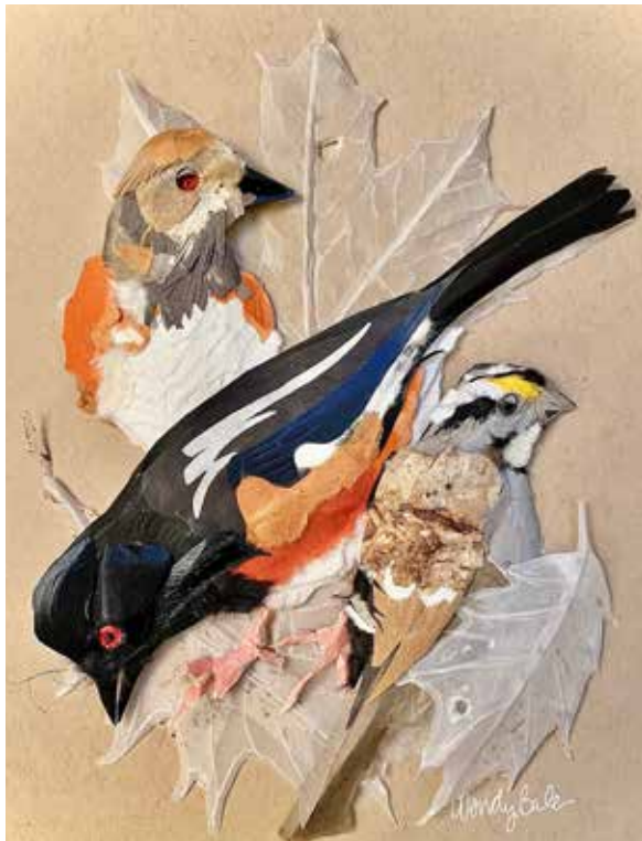
Colorful Sparrows Paper Sculpture 10 x 8"