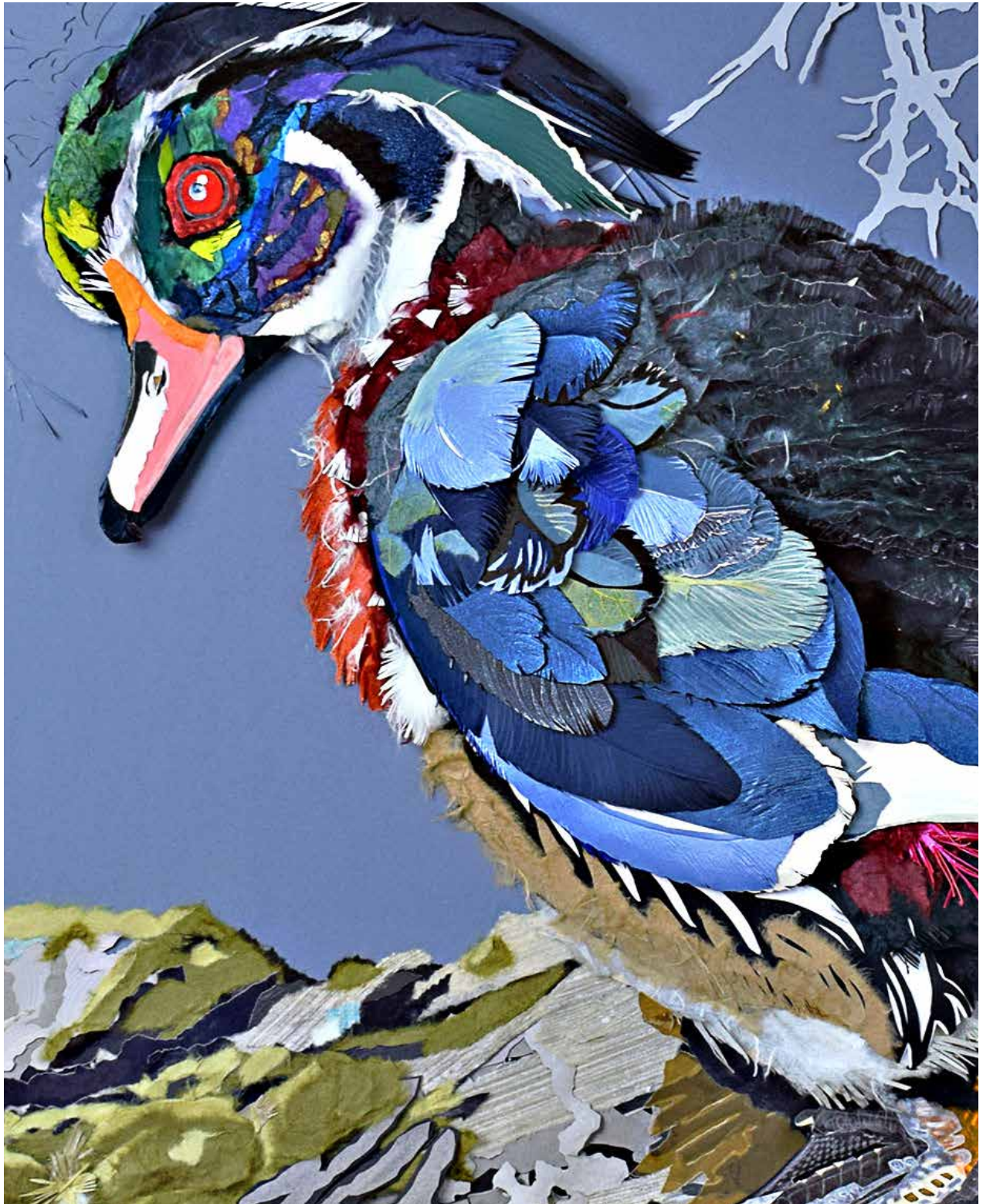
Wary Wood Duck, Cut Paper (detail) 24 x 30"

Wendy Bale drawings paper arts & sculpture