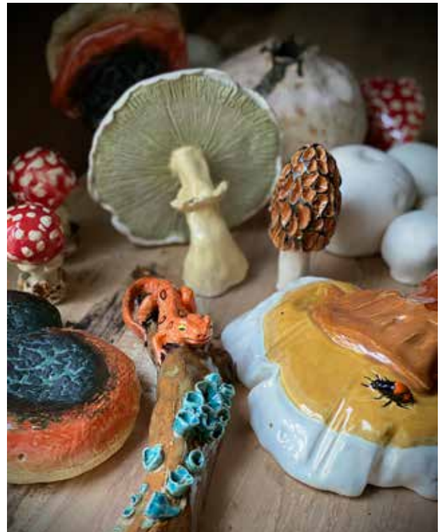
Mushroom Menagerie Ceramic Sculpture detail